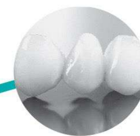
Fig. A: Failed QC

After QC testing, our high powered microscope detected a marginal gap that was 20 microns too large. So we went ahead and created a new one from scratch.